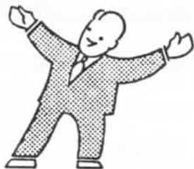
LADIES & GENTLEMEN